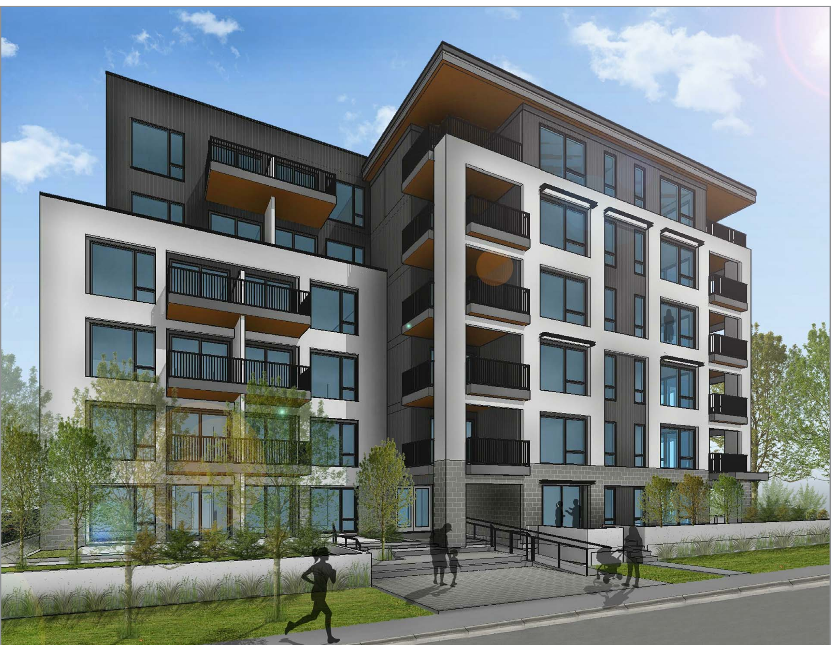
View north, from 33 Avenue NW.