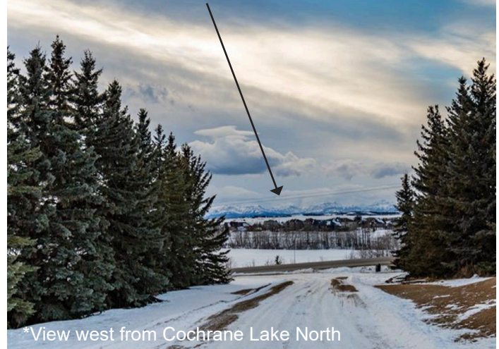
*View west from Cochrane Lake North